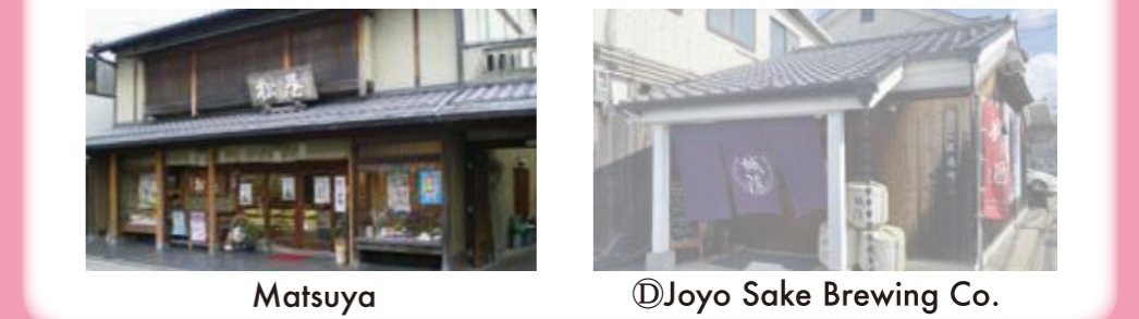
Matsuya ⑥ Jyo Sake Brewing Co.

Recommended for those who enjoy scenery untouched by time. In Matsuya, a traditional sweets shop, see many of the old signs and other remnants from its days as an Edo-style inn. Also visit Southern Kyoto's only old-style sake brewery and sample the sake and plum wines available for purchase. Enjoy seasonal flowers and plum groves on this trail.